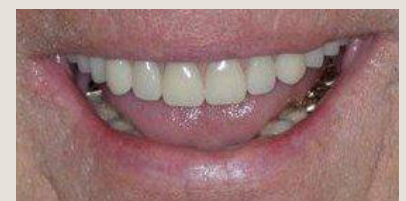
Restores smile and function