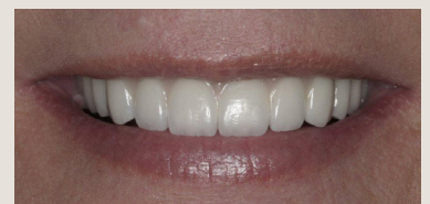
Builds back smile