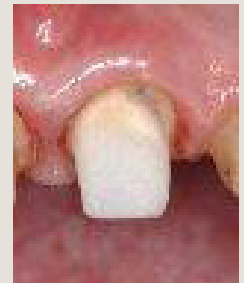
Broken down tooth built up with metal post and composite core